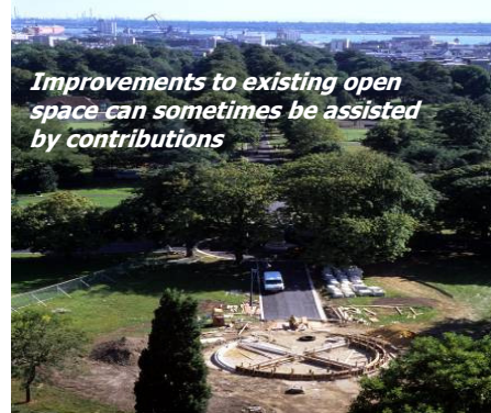
Improvements to existing open space can sometimes be assisted by contributions

walking and cycling opportunities are available to all, and which allow people to access the wider countryside. Others have strong parks strategies with resources directed at meeting key qualitative, quantitative or accessibility needs for different types of open space and outdoor recreation.